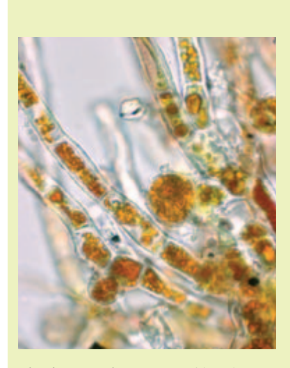
The brown alga Trentepohlia abietina: The picture shows mature gametangia in the basal part of the alga.

The fascinating ornamentation of diatom cell walls is generated through directed biomineralisation. The processes involved in the natural polymerization are prototypic for further developments in material sciences.